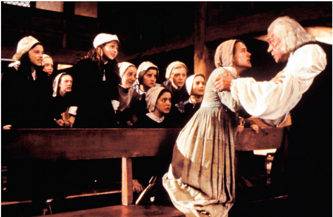
Judge Danforth questioning Mary Warren

Danforth. How were you instructed in your life? Do you not know that God damns all liars? ( She cannot speak. ) Or is it now that you lie?